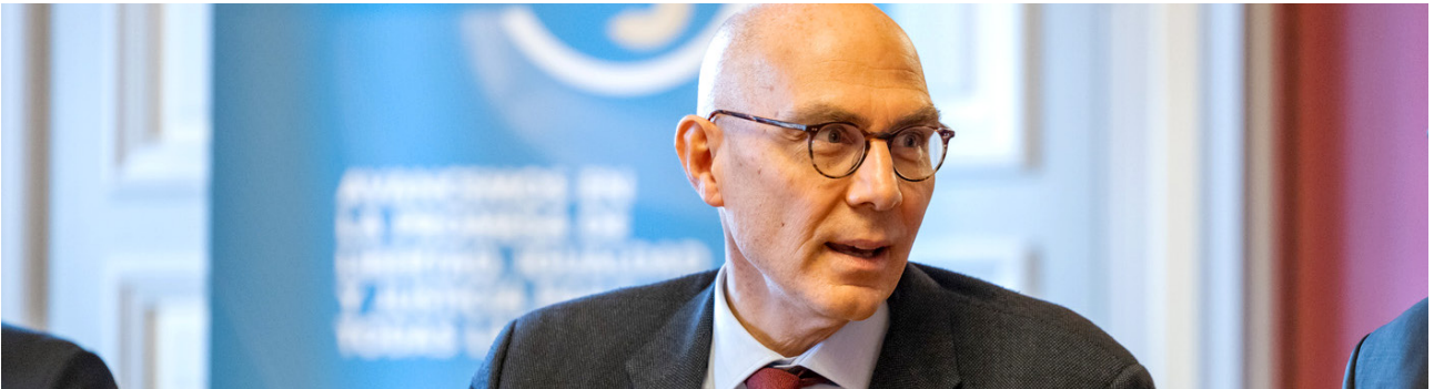
Closing session and award ceremony of the UN Fellowship Programme for People of African Descent with the High Commissioner for Human Rights Volker Türk, 1st December 2023, Palais Wilson, Geneva, Switzerland.

Given the growth and complexity of issues before them, global and regional human rights institutions and mechanisms must continue to innovate for the purposes of effectiveness, accessibility, interconnectedness, transparency, responsiveness and inclusivity.