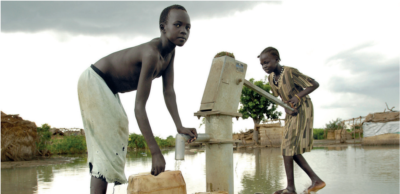
Children displaced by flooding collect water from a submerged hand pump.

For many countries, though, the fiscal space to invest in education, health, social protection and other public services is thin due to crippling debt burdens. Prioritizing spending in these areas, including through ringfencing, in order to meet human rights commitments are economic decisions that should not be undercut by debt repayments.