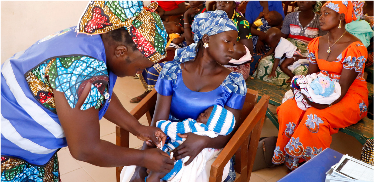
A nurse administers a malaria vaccine to an infant at the health center in Datcheka, Cameroon, 22 January 2024.