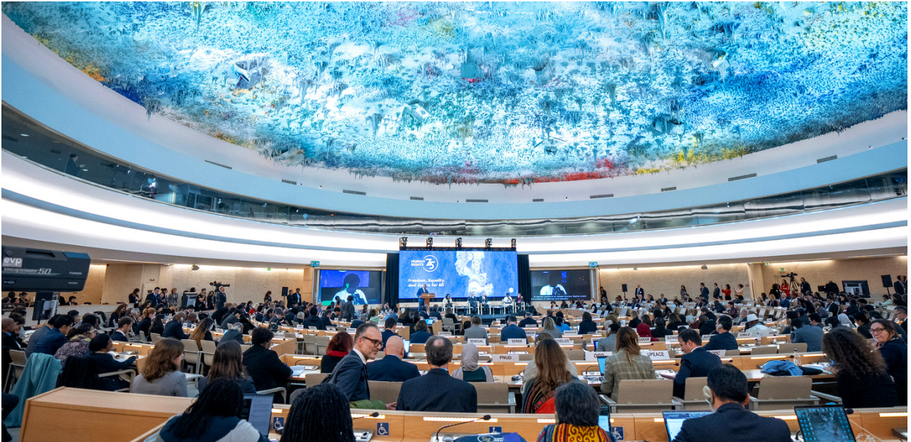
A general view the closing of the 75th anniversary of the Universal Declaration of Human Rights at the United Nations Headquarters in Geneva, 12 December 2023.