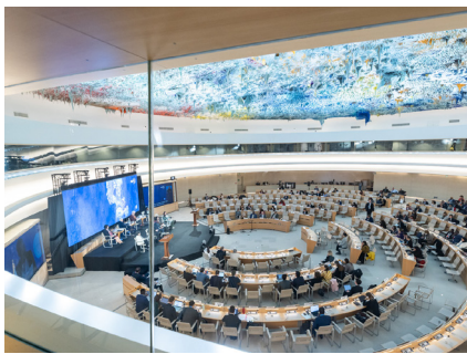
Human Rights 75 High-Level Event in Room XX, Palais des Nations

We must use the momentum from Human Rights 75 to resolve to do things differently, conscious of the many lessons from the wins and failures in the decades since the Declaration's adoption. This means embracing fully all human rights – civil, political, economic, social and cultural, as well as the right to development, the right to a healthy environment and the right to peace - moving resolutely away from the unhelpful artificial divides erected in the past. Human rights must be at the centre of rebalancing our economies so they start working for all people and for the planet. Human rights can also free us from the impasse on addressing the triple planetary crisis and equip us to manage successfully the technology revolution. We must, at long last, act on their blueprint for ending cycles of bloodshed.