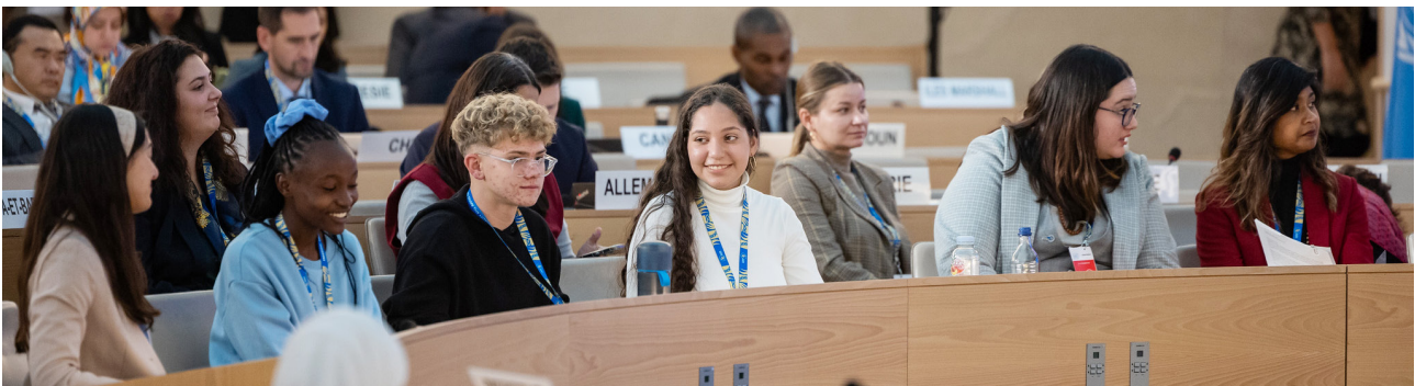
75th anniversary of the Universal Declaration of Human Rights at the Palais des Nations, 11 December 2023, Geneva, Switzerland.