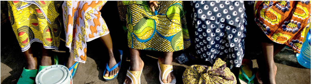
Women sit together outside their dormitory at the Heal Africa Transit Center for women victims of sexual violence. Due to funding gaps, they are unlikely to receive consistent humanitarian programming for prevention or reintegration. © Aubrey Graham