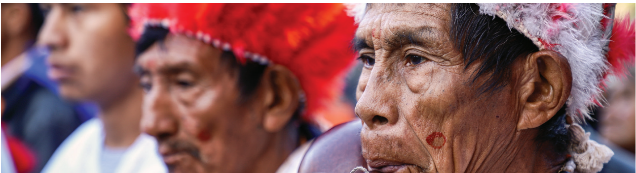
Indigenous Peoples march in Paraguay.

The vibrancy, dynamism and diversity of this constituency underlines the continued legitimacy of human rights, their universal nature and their resilience for the future.