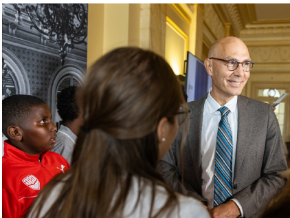
United Nations High Commissioner for Human Rights, Volker Türk, meets young people from Geneva schools during the Open Day at Palais Wilson, on the occasion of the 75th anniversary of the Universal Declaration of Human Rights.

Our choice is clear – embrace and trust the full power of human rights as the path to the world we want: more peaceful, equal and sustainable. To do this, we must affirm human rights as protection – a guardian against abuse, a guarantor of accountability and the ultimate tool of prevention. But we must also understand human rights as a propulsive force to meet today’s and tomorrow’s challenges. Unlocking fresh ideas and tools, generating the resilience needed for the shocks we face and those yet to come. This entails honest, constructive, albeit at times uncomfortable and difficult, conversations. This is how societies can evolve, heal and change – and our global community overcome tensions and forge solutions in the common interest.