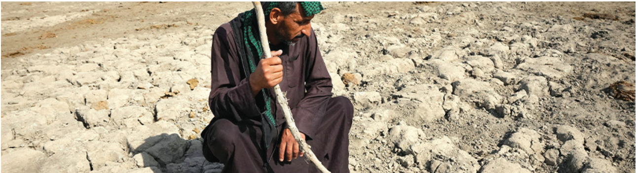
A man contemplates the dried lands in the marshes of Southern Iraq.

For too long, the health of our planet has been sacrificed for ill-considered and inequitable material gain. The impacts of our triple planetary crisis are equally unfair, with the severest effects landing on the most vulnerable and least responsible.