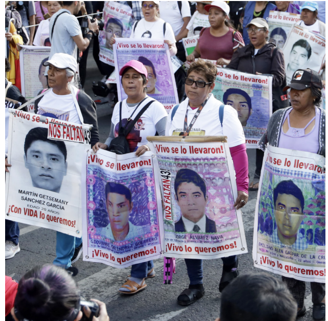
The mothers and fathers of the 43 students from the Ayotzinapa Normal School march in the commemoration of the ninth anniversary of their forced disappearance, demanding justice during the protest in Mexico City.

Governments must also ensure effective routes for holding corporate actors to account for human rights harms. The accountability gap is apparent in relation to corporate responsibility, along with that of States and individuals, when it comes to environmental harms. This calls for innovative approaches. The potential of criminal law to deter harmful conduct and provide remediation deserves exploration, including efforts to establish the international crime of ecocide. We should also consider transitional justice approaches; for example, through an international commission of inquiry to investigate the causes of environmental damage, both as an act of memorialization and in order to issue practical recommendations to States.