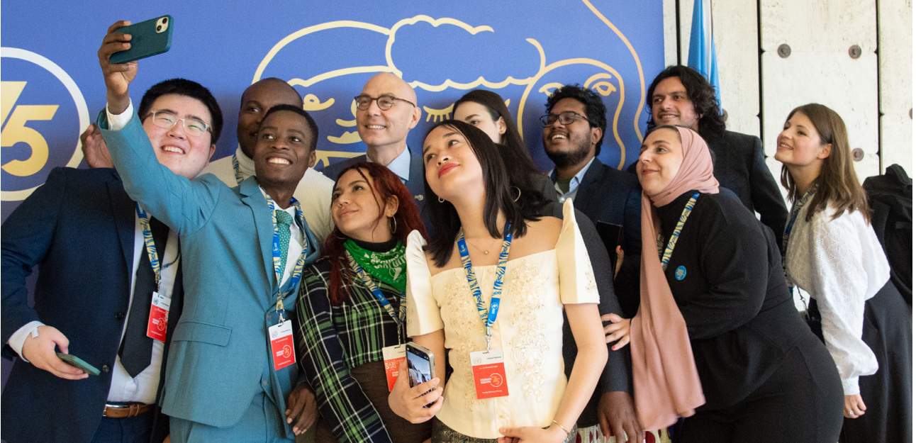
During the 75th anniversary of the The Universal Declaration of Human Rights, High Commissioner Volker Türk meets with 12 young representatives of the Youth Advisory Group at Palais des Nations in Geneva, Switzerland, 11 December 2023.

human rights. Capacity-building and support, including human rights education, are essential to empowering children and realizing their vision of a fairer, safer and happier world for all with human rights at the centre.