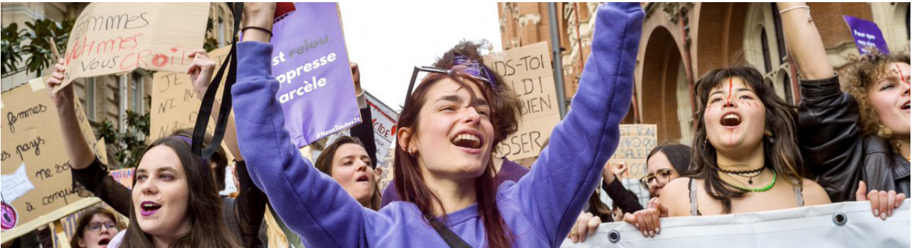
A young woman dances and sings at the head of the procession. International Women's Day, Toulouse, France, 08 March 2022