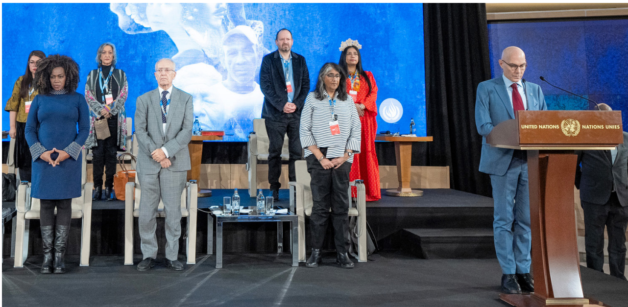
Volker Türk, United Nations, High Commissioner for Human Rights, observes one minute of silence during the Opening Ceremony of the 75th anniversary of the Universal Declaration of Human Rights (HR75) to mourn and honour all victims of human rights violations.

ments. In all peace work, human rights are by nature inclusive, necessitating the meaningful participation of women, young people and others routinely excluded. Accountability and transitional justice are integral to human rights, as are their capacity to nurture compassion, healing and trust when societies emerge from conflict.